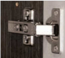
JOSEPH BLUM HINGES are rated at 100,000 cycles and are lifetime warranted.