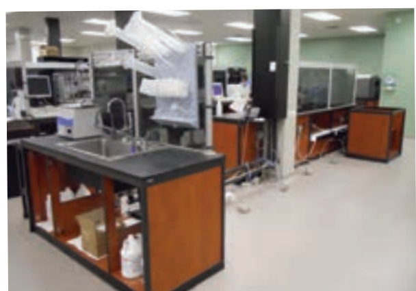
reconfiguring Modular Millwork 1:00 am