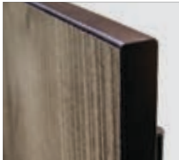
DUAL-SIDED LAMINATES with high impact-resistant 3 mm edges provide aesthetic durability and style.