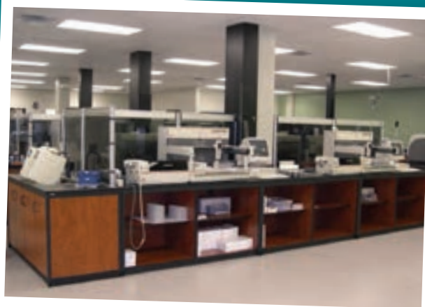
original parallel processors 9:00 pm