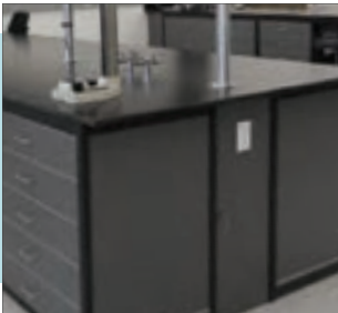
ISLAND CHASE Enjoy easy access to utilities inside stations via the hinged access doors.

Modular Millwork’s integral chase design lets you compress lab construction, updates and occupancy time and saves substantial time and money. You no longer have to trench floors and demo walls to distribute utilities. Simply configure your lab as desired and distribute utilities wherever needed via the integrated chase.