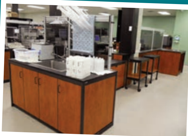
ready for innovation 3:00 am