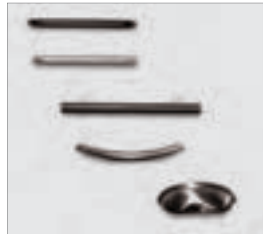
DESIGNER HARDWARE tastefully finishes your lab without compromising functionality.