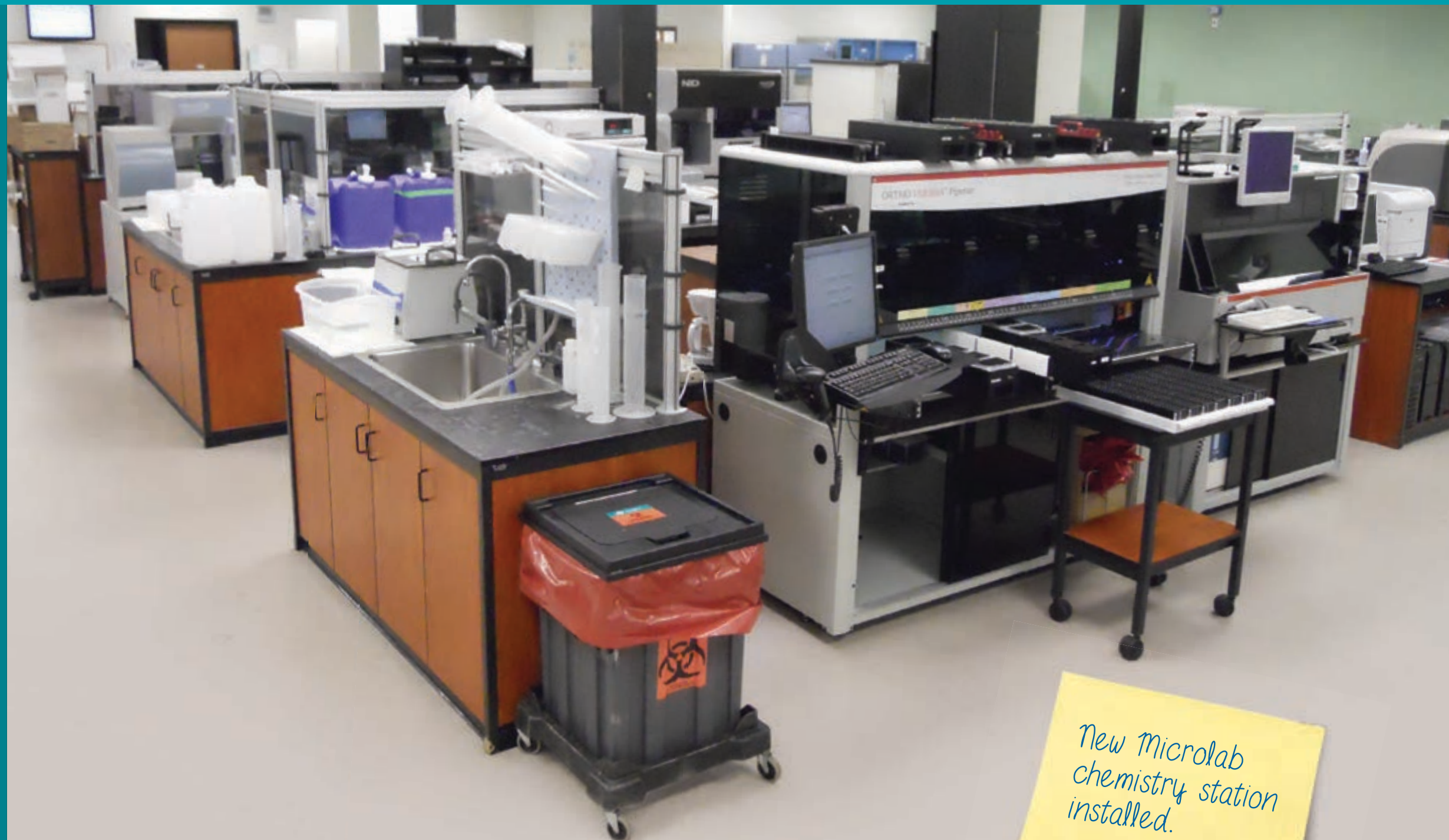
New Microlab chemistry station installed.