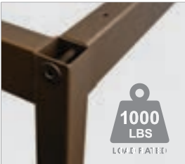
PRECISION-WELDED FURNITURE STEEL FRAMES (12 gauge) mean heavy equipment is safe and secure.

Modular Millwork is engineered to last. High impact-resistant edges, lifetime warranted hinges and the modular structural integrity of our cabinetry are only the beginning of the superior quality you receive.