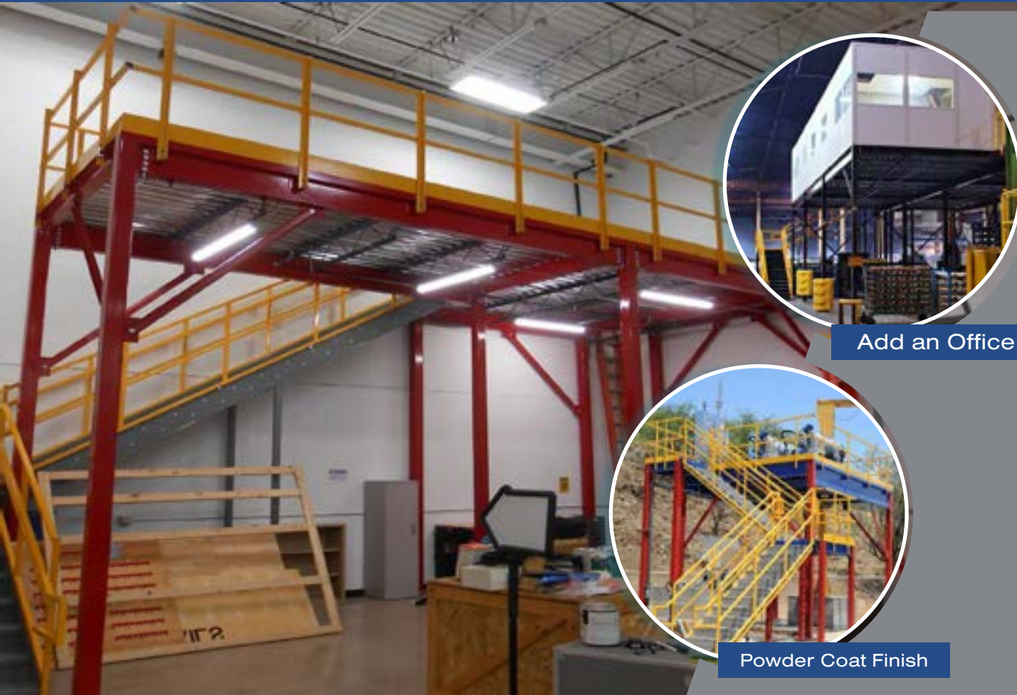
Add an Office