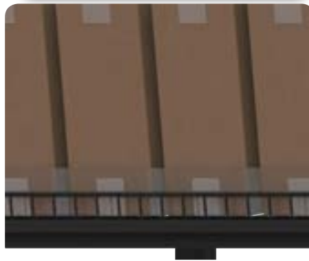
Clear Front Rail