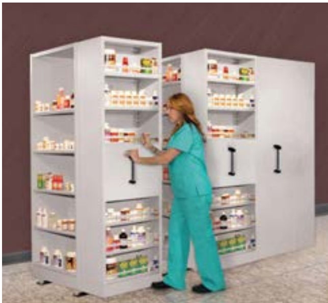
End-Stor™ for quick access applications such as pharmacies.