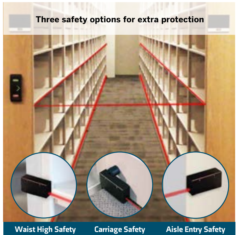
Three safety options for extra protection