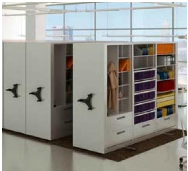
Shared Departmental Storage with Hanging Files