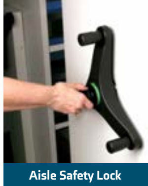
Aisle Safety Lock