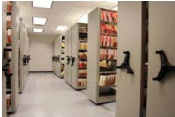
High Density Filing