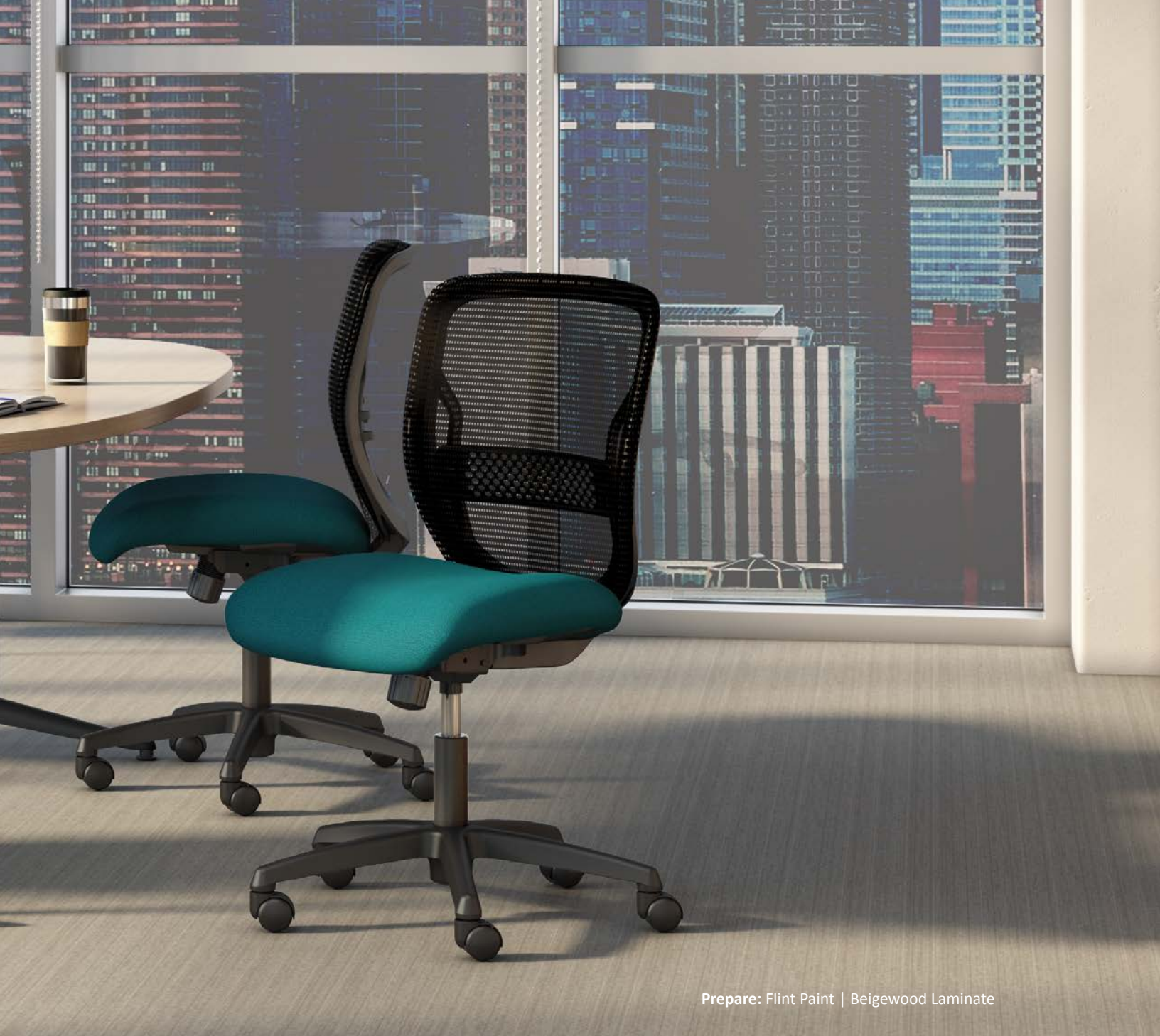
Prepare: Flint Paint | Beigewood Laminate