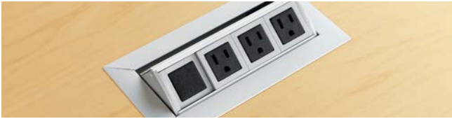
Power, data port