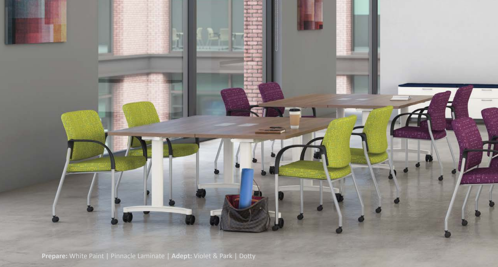
Prepare: White Paint | Pinnacle Laminate | Adept: Violet & Park | Dotty