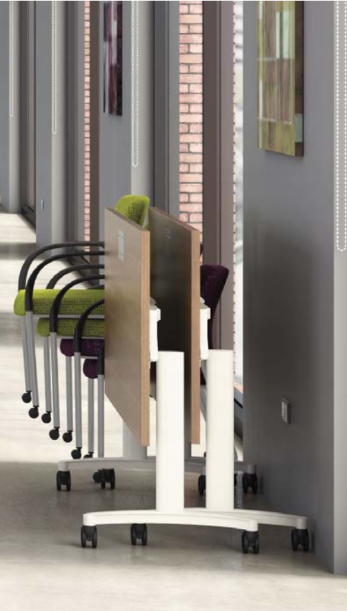
Mobile nesting tables