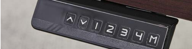
Height adjustable memory control