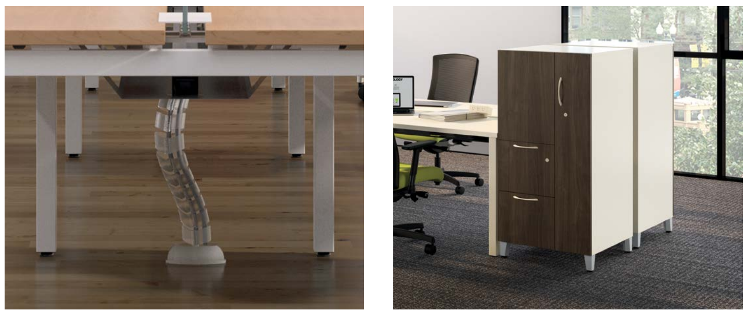
Integrated power trough with wire management