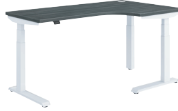
3 Stage 2 Leg C Foot