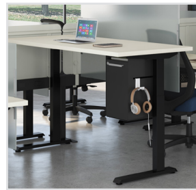
Add Nif-T Storage