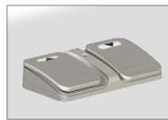
Foot Pedal (FPD)