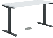
2 Stage 2 Leg T Foot