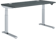
2 Stage 2 Leg C Foot