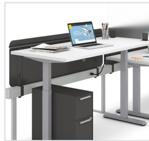
Add Screens for more Privacy