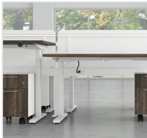
Pairs with MXitUP Power Beam