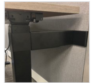
HAT Panel Bracket