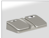
Foot Pedal (FPD)