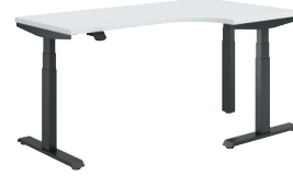
3 Stage 3 Leg T Foot